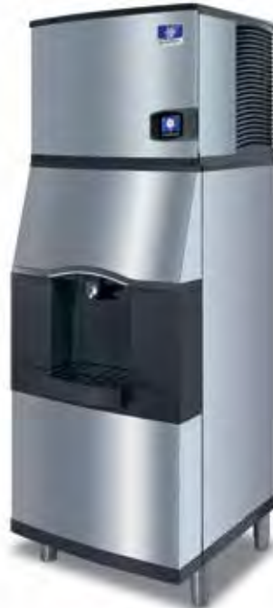
Indigo NXT iT0450 Ice Machine SPA-310 Ice Dispenser

With Indigo and Indigo NXT ice machines you can program the ice machines to be off certain hours of the day so that while the hotel guests are sleeping, the ice machine can be too!