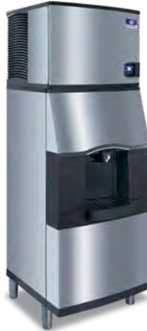
Indigo NXT iT0450 Ice Machine SFA-291 Ice & Water Dispenser