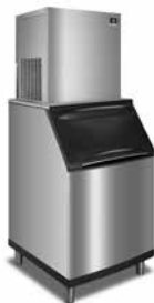
RNS-1078C Remote Nugget Ice Machine on B-570 Bin