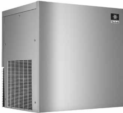
RNS-1078C Remote Nugget Ice Machine - 115V