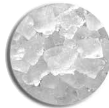
Ice shown actual size

Nugget ice consists of small pieces ranging from 3/8" to 1/2" in width and length. Offers a 90% ice to water ratio with a soft, chewable texture while still providing maximum cooling and great dispensibility.