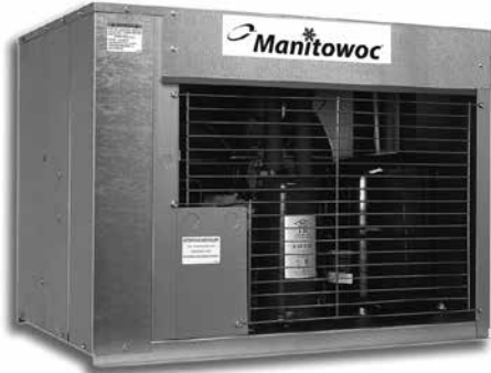
RCU Condensing Unit - 208-230V