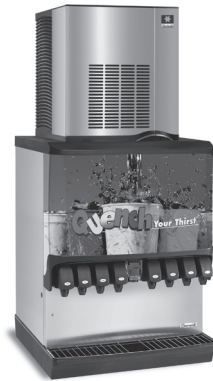
RN-0408A Nugget Ice Machine on Servend SV-250 Dispenser