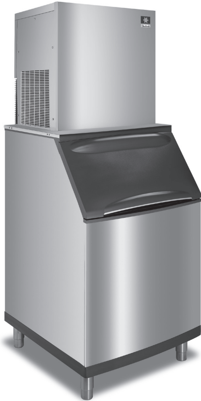
RFS-1279R Low-Side/Rack Flake Ice Machine on B-570 Bin