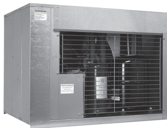
CVD Condensing Unit - 208-230V

QuietQube ice machine with CVD condensing unit is designed as a Manitowoc system and cannot be used with any other ice machine or remote condenser brand.