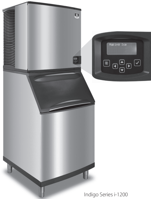
Indigo Series i-1200 Ice Machine on B-570 Bin

Designed for operators who know that ice is critical to their business, the Indigo™ Series ice machine's preventative diagnostics continually monitor itself for reliable ice production. Improvements in cleanability and programmability make your ice machine easy to own and less expensive to operate.